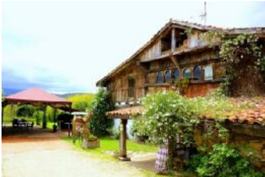
Traditional charm Basque restaurant

Goodbye lunch at a historical traditional farm house charm restaurant with quality Basque cuisine.