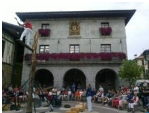
Basque lumberjack exhibition

All surrounded by nature into one of the most beautiful natural parks of the Basque Country.