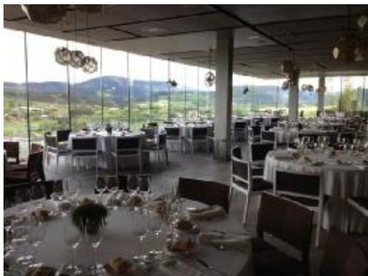
3 Michelin star restaurant

Special Gala Dinner at a 3 Michelin star restaurant. Personalized welcome by the Chef, appetizers in three levels and visit to the orchard of the restaurant before tasting dinner.