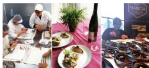
Anchovy traditional handcraft

Later we continue to the coast to the charming fishermen village of Getaria. Visit to the old quarter and special visit to a handcraft anchovy workshop with exhibition and tasting of different levels.