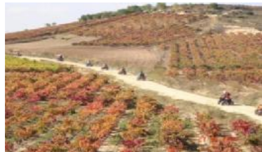
Quad Route into the wine region

Afterwards a unique fun Quad Route into the famous vineyards and wineries of the Region