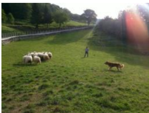
Sheppard dog exhibition

Buffet breakfast at the hotel. In the morning we will visit into a charming rural environment the only Sheppard School in Europe with exhibition of Sheppard dog, elaboration of Idiazabal Basque famous cheese, tasting of cheese and Txakoli.