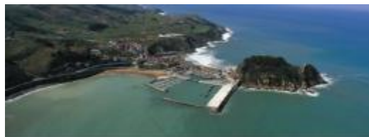
Panoramic view of Getaria

All surrounded by nature into one of the most beautiful natural parks of the Basque Country.