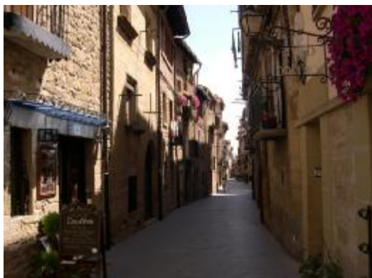
Medieval streets of Laguardia

After lunch walking visit into the charming medieval village of Laguardia.