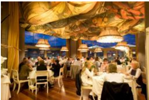
1 Michelin restaurant