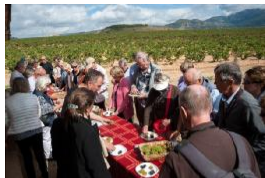
Grape tasting into the vineyards

Guided visit with wine tasting & grape tasting to one of the most important and historical wineries in Rioja.