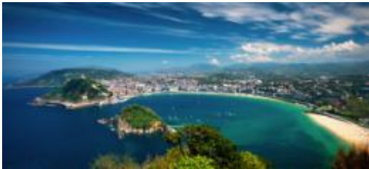
Panoramic view of San Sebastian

After lunch, walking visit into the old town of San Sebastian.