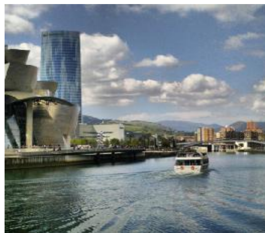
Boat trip river of Bilbao

Afterwards we will enjoy an interesting Boat trip all along the river of Bilbao towards the coast to see along the banks of the river the historical industrial past of the city. Some drinks and appetizers included.