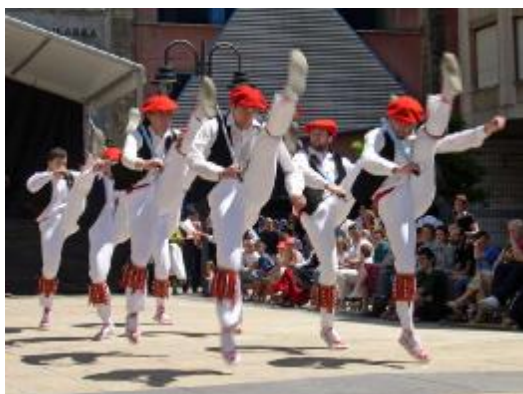
Basque Dancers exhibition

Additionally, before dinner we will enjoy a unique welcome exhibition of Basque Dancers