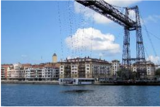
Transporter Bridge of Biscay

Guided visit & cava glass on top of the Transporter Bridge of Biscay, the oldest in the world and Heritage of Humanity by Unesco.