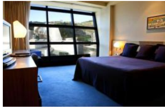
Room with views to Guggenheim

Check in at the selected hotel and some free time to refresh.