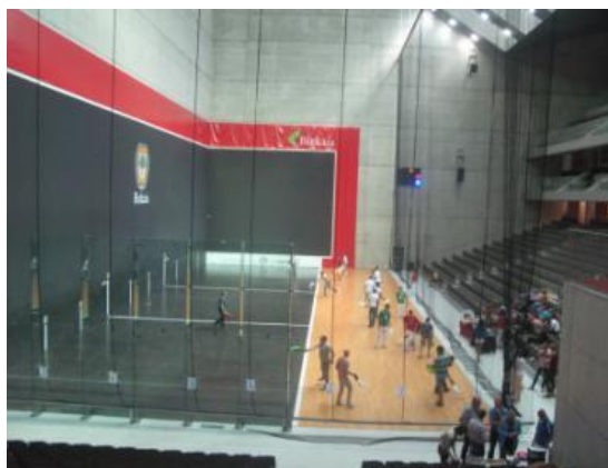
Jai Alai interactive fun part

Buffet breakfast at the hotel. in the morning we will enjoy a unique Basque ball game.....JAI ALAI, the fastest ball game in the world, with introduction, exhibition, bets, prizes & interaction.