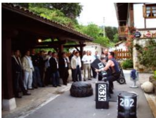
Stone lifters exhibition

Additionally, during the tasting we will experience an exhibition of traditional Basque rural exports like; lumberjacks & stone lifters.