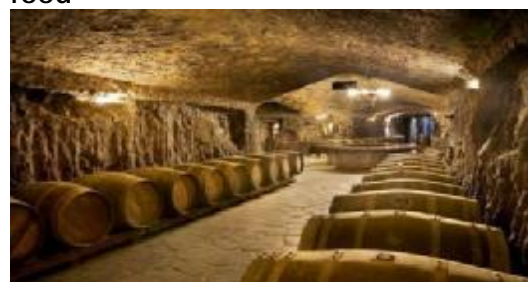
Caves into winery Rioja

Lunch into the caves of a renowned winery with blind tasting of wines & food