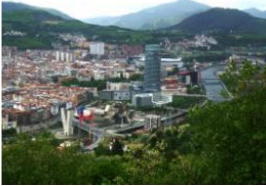
Panoramic view from Artxanda

Arrival to the airport of Bilbao. Welcome by the guide and transfer to Bilbao, to the top of Mount Artxanda.